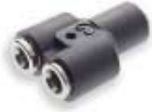
Pneufit Parallel Union "Y"*