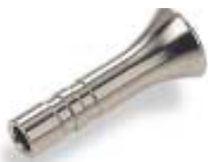
* Material: Nickel plated Brass