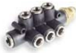
Manifold* (O/D tube)