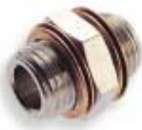
Pneufit ISO G Hex Nipple (Supplied with sealing washers)