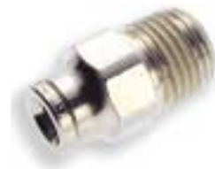
Pneufit ISO G Male Adapter