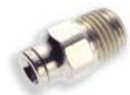
Pneumatic Male Adapter