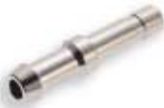
Pneufit Barb Adapter