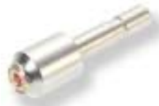
Pneufit Pressure Indicator