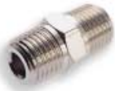
Pneufit ISO R Hex Nipple