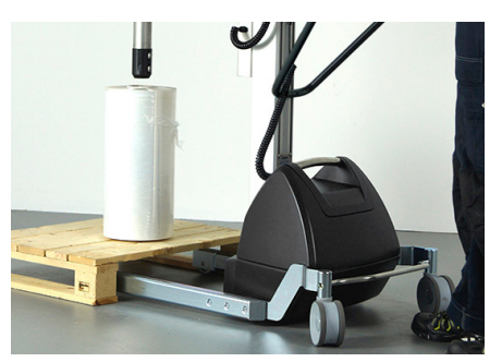
On several models, the measuresments of the wheels make it possible to drive the lifter into a pallet in three different ways.