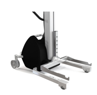
Fork for shafts

Handling of various goods. Optimal for reaching into narrow spaces.